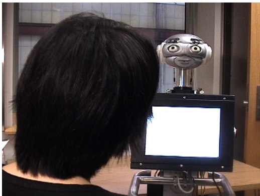
Fig. 2. Experimenter with robot, as seen by participants.

The knowledge estimation procedure in Experiment 2 was a replication of that in Experiment 1 with one exception. To avoid the possibility that some students in Hong Kong might not recognize Columbia University, we changed the identity of the U. S. university from Columbia University to New York University.