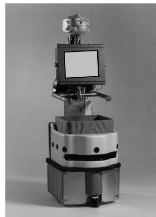
Fig. 1. Robot viewed in experiment.

In the current experiments, we asked participants to estimate the likelihood that a robot made in New York or Hong Kong would know and recognize landmarks in these cities. Half of the participants (HK condition) were told that the robot was built at a robotics institute at the Hong Kong University of Science & Technology and the other half of the participants (US condition) were told that the robot was created at a robotics institute in a university in the United States (Columbia University). Participants were shown pictures of these universities.